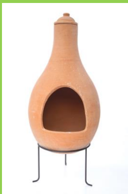
Large Fire Pot

Every Chiminea “Fire Pot” comes standard with the following: